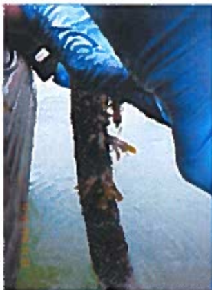
Fig 5 Mussel seed on main collector rope, northern site (B13)