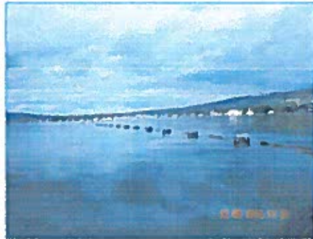
Fig 4 Northern spat collector (B13)