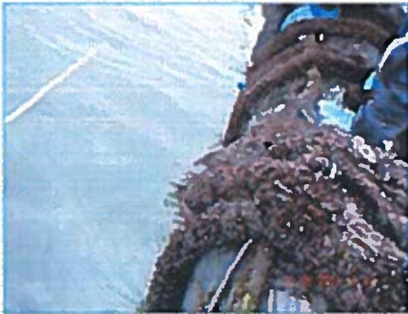
Fig 3 Sub-collector, six ropes at the southern site (B24)