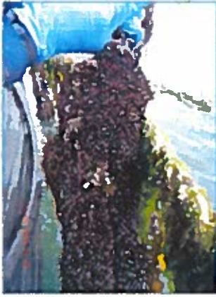
Fig. 1 Mussel seed on main collector rope, southern site (B24)