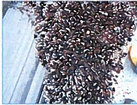
Fig. 2. Seed mussel from the southern sub-spat collector (B24)