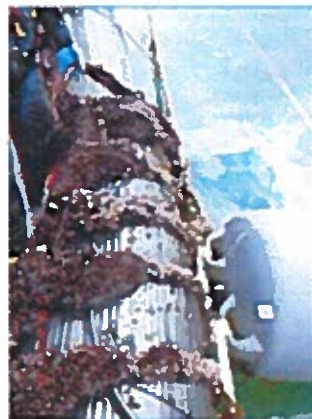
Fig 6 Sub-collector, six ropes, northern site (B13)