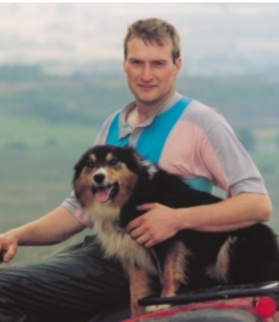
Man's best friend - be aware of the disease risks

Dogs and cats should not be fed household scraps as foot and mouth outbreaks have been attributed to improper disposal of waste meat products.