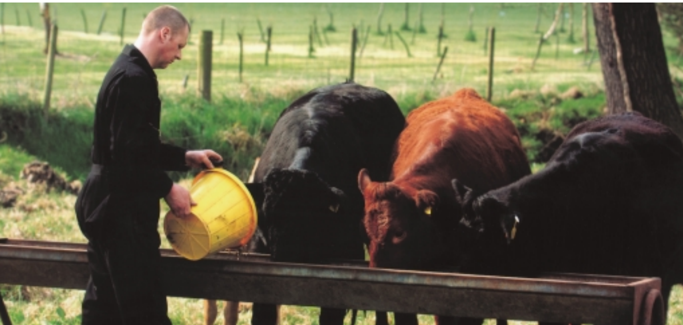
Raise troughs and reduce contamination