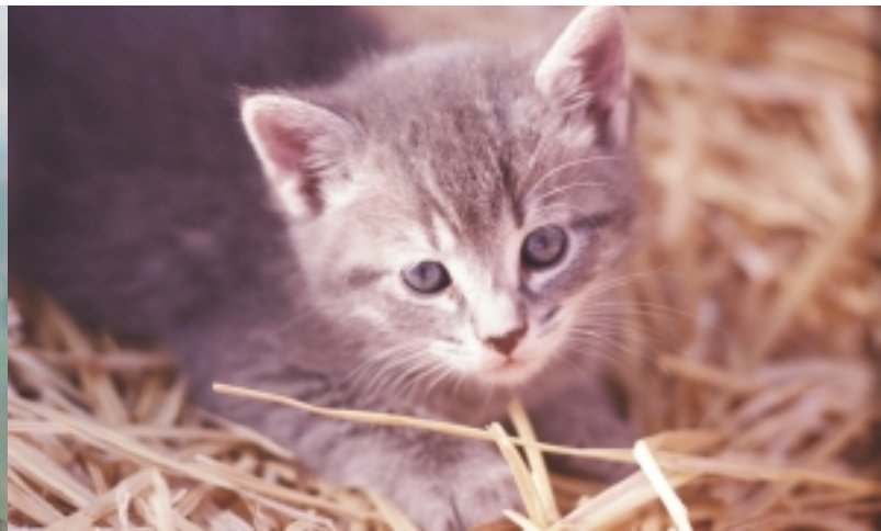
Be aware of the disease risks