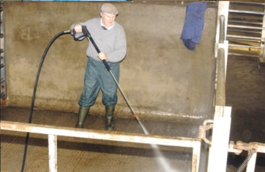
Farmers and all those involved in the Agri-food industry have their part to play in Biosecurity