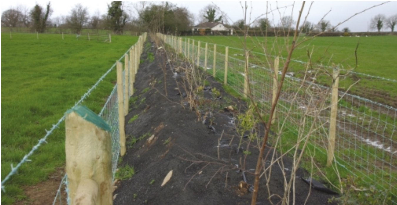
Keep your stock separate from your neighbours' stock