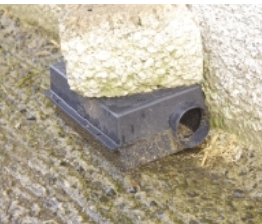
Keep vermin under control